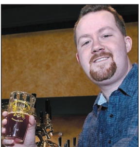
Jaycees to hold Microbrew Festival Saturday, C1