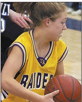
Roncalli edges Two Rivers in EWC tussle, B1